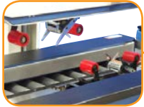
Offset tape heads process 2" high cases