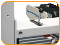
Single handle locks upper head to both columns