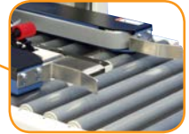
Case retainer in-feed guides