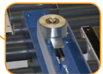
Self-tensioning & tracking side drives simplify belt replacement