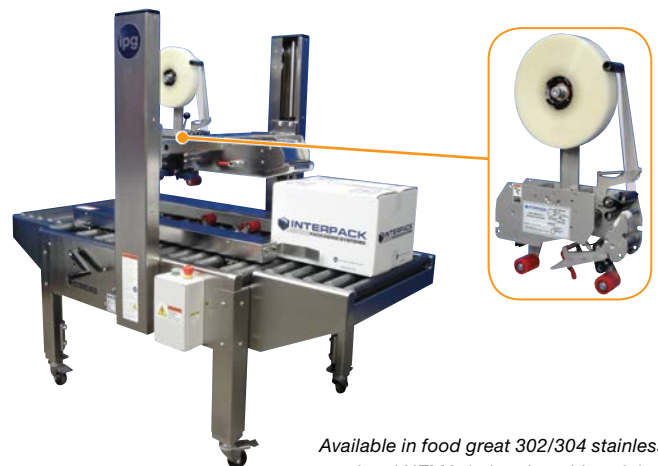
Available in food grade 302/304 stainless steel and NEMA 4 electrics with stainless steel HSD 2000-ET II taping heads.