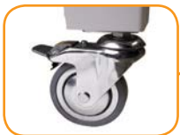
Optional swivel and locking casters