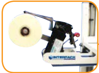
Tip-up tape head simplifies roll replacement