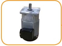
1/2 HP motors for heavy duty usage