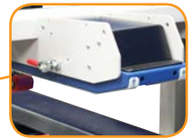
"Floating" upper head for mild overfills