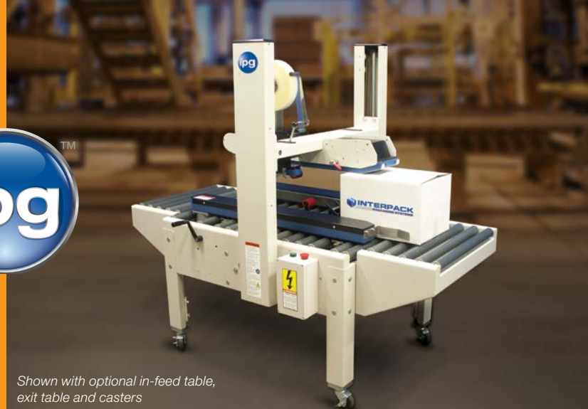
Shown with optional in-feed table, exit table and casters