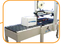
Optional in-feed or exit tables available in 16, 24, or 36 inch lengths