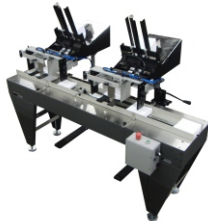
RXSD-2 Batch Count Collator