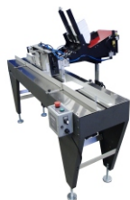
RX-12bc with Victory SD Dropper

Enjoy all the benefits of a fully-automated batch count collating system without breaking the bank! Count, stack, accumulate, and collate at the lowest price on the market. Configure one to 25 RX-12bc/dropper stations to integrate with wrappers/sealers, auto L-bars, strappers, cartoners, and more for products 3" x 3" up to 12' x 12".