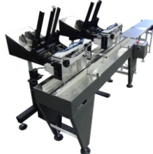
RXSD-2 onto Flat Belt Conveyor