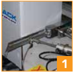
1 Pneumatic arm squares cases before sealing