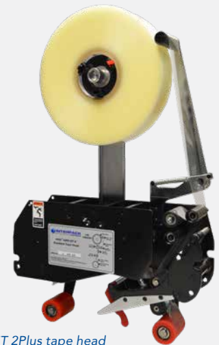
ET 2Plus tape head

These vertical format case erectors offer an expanded range of case sizes versus horizontal format erectors. Their compact footprints conserve floor space while improving productivity.