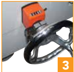
3 Analog counters simplify changeover