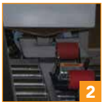
2 All 4 flaps folded pneumatically