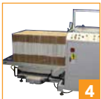
4 48" powered hopper holds up to 150 cases